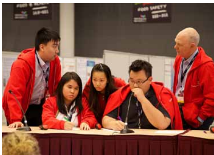
BCIT Students at the CIFST Student Challenge Cup