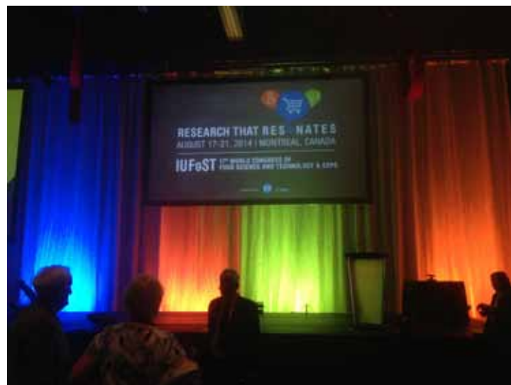
The 17th World Congress of Food Science & Technology held in Montreal.

With a global perspective, the conference had a lot of interesting sessions regarding food research