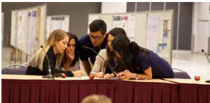
UBC Students at the CIFST Student Challenge Cup

We are grateful for the opportunity to attend this conference on behalf of BCFT and expand our networks and horizons in the field of food science.